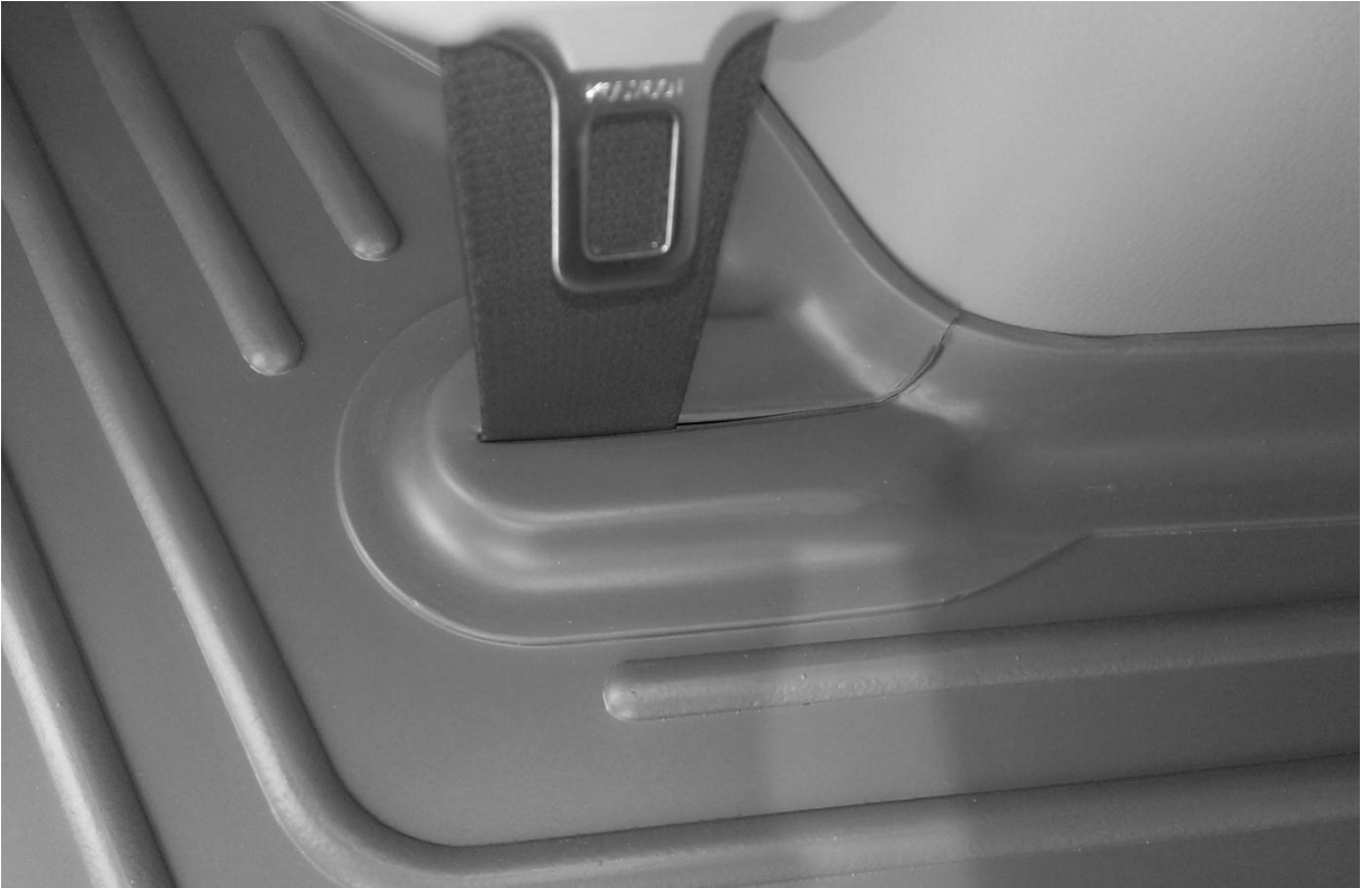
IMAGE SHOWING LINER TRIMMED AND SEAT BELT INSERTED INTO TRIMMED SLOT.